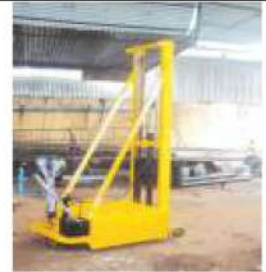
Counter balance stacker