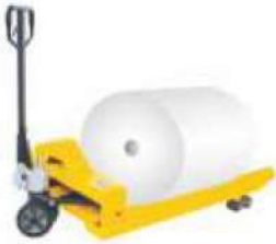
Roll Pallet Truck