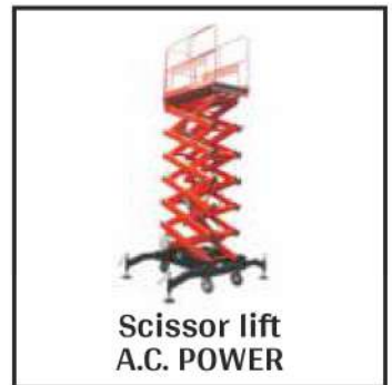
Scissor lift A.C. POWER