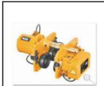
Electrical Push Pull Trolley