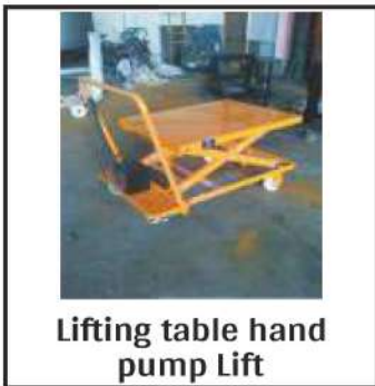
Lifting table hand pump Lift