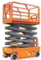
Fully Electrical Lift Table