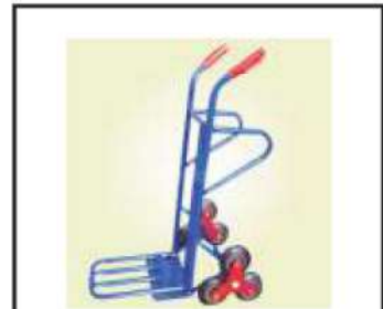
Stair Clamping Trolley