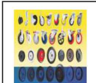
Wheel and tyre