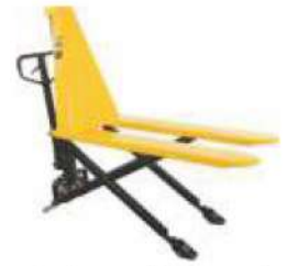
Scissor Manual Hand Pallet Truck