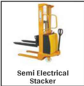
Semi Electrical Stacker