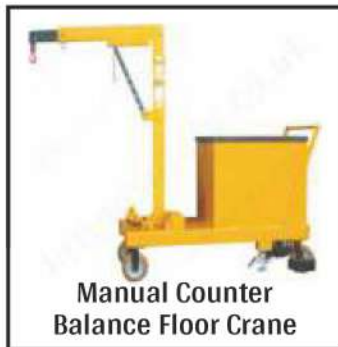
Manual Counter Balance Floor Crane