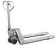
Hyd Pallet Truck SS