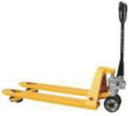
Hyd pallet Truck