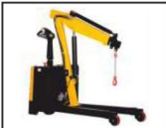
Battery Operated Counter Balance Boom Crane