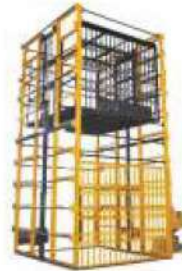
Hyd Goods Lift