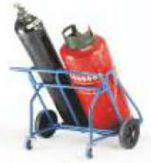
GAS TROLLEY DOUBLE CYLINDER