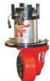
Drive Unite Vertical