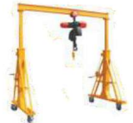
Gantry Crane (A Frame)