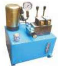
Ac Power Pack