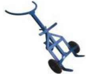
Manual Drum Trolley