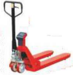
Weighing Scale Hand Pallet Truck