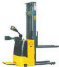
Fully Electrical Stacker