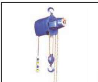
Electrical Chain Hoist