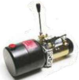
Dc power pack