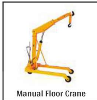
Manual Floor Crane