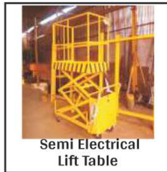
Semi Electrical Lift Table