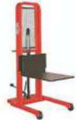
Manual Platform Stacker