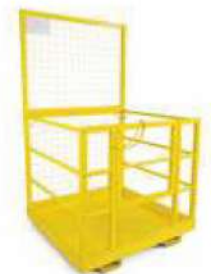
Man Lift Cage