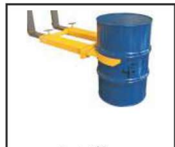
Fork Lifter Drum Grabber