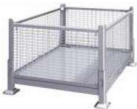
Wire Mesh Pallet