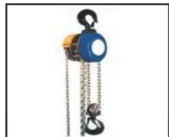
Chain Pulley Block