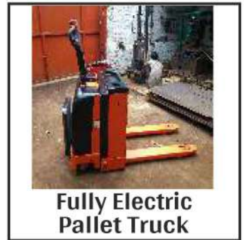
Fully Electric Pallet Truck