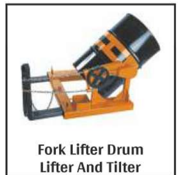
Fork Lifter Drum Lifter And Tilter