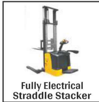
Fully Electrical Straddle Stacker