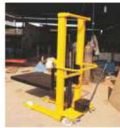
Manual Hand Pump Stacker