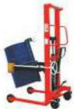
Drum Lifter & Tilter