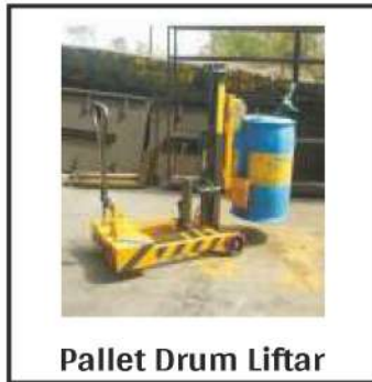
Pallet Drum Lifter