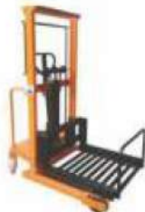
Manual Roller Platform Stacker