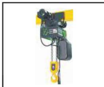
Fully Electric Chain Hoist