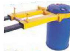
Forklift Manual Drum Attachment