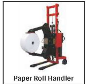
Paper Roll Handler