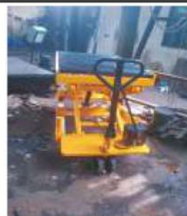
Manual Lift Table