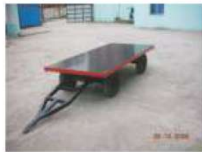
Trolley Material Handling Cap