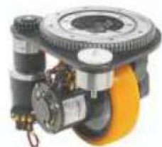
Drive Unit Horizontal