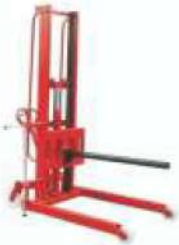
Manual Boom Stacker